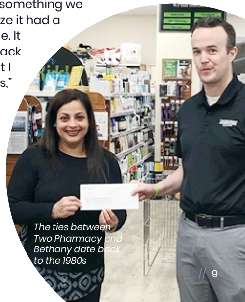
The ties between Two Pharmacy and Bethany date back to the 1980s